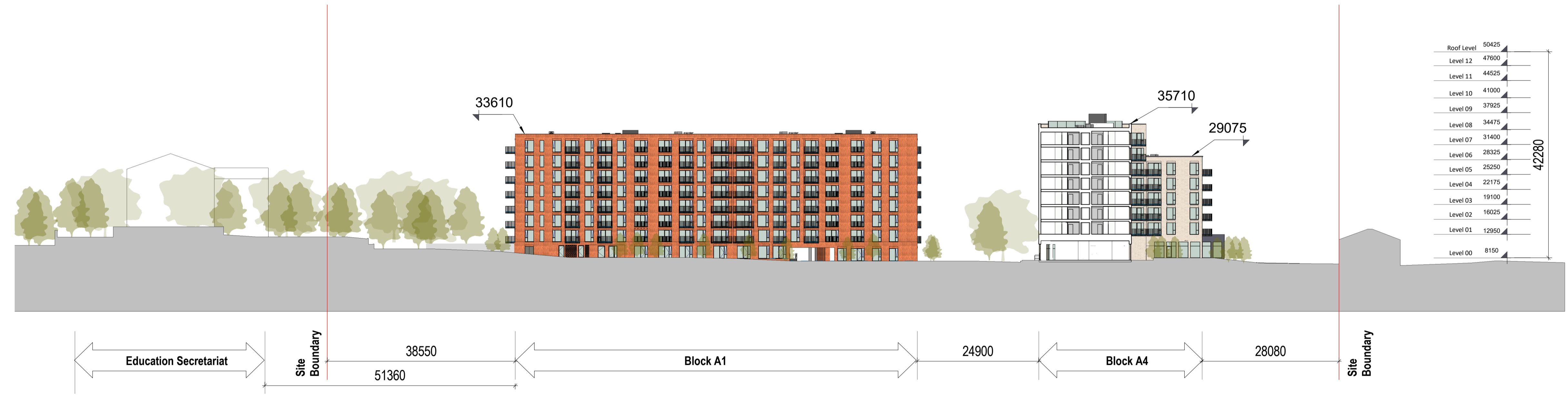
② Site Section 2 1:500