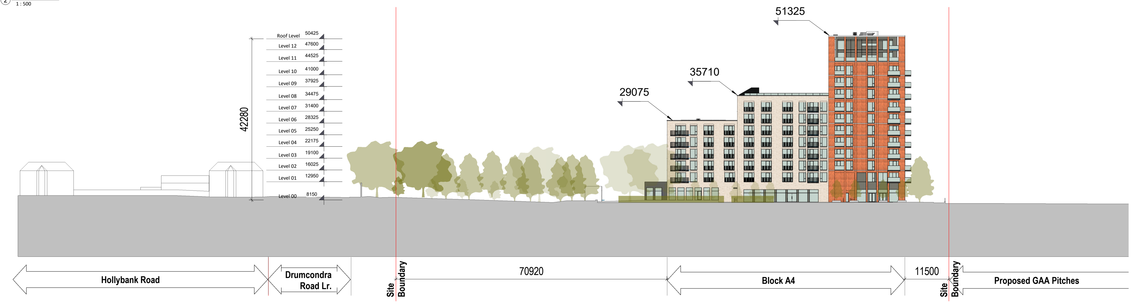
① Site Section 3 1:500